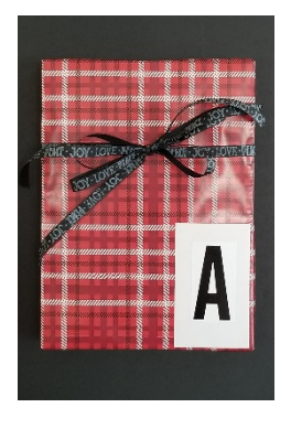
Red, White, and Black Plaid Paper with a Black "Love, Joy, Peace" Ribbon