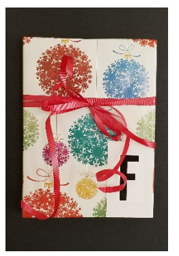
Snowflake Ornaments Paper with Red Ribbon