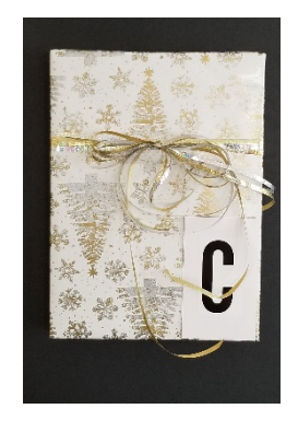
Mercury Glass Christmas Paper with Gold AND Silver Holographic Ribbons