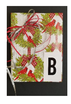
Cardinals in Wreaths Paper with Red AND Silver Ribbons