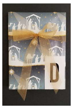
Nativity Night Paper with Gold Ribbon