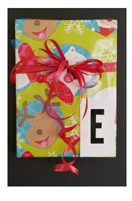
Catching Snowflakes Paper with Red Ribbon